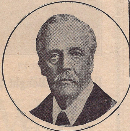
EARL OF BALFOUR, Author of Declaration Bearing His Name.